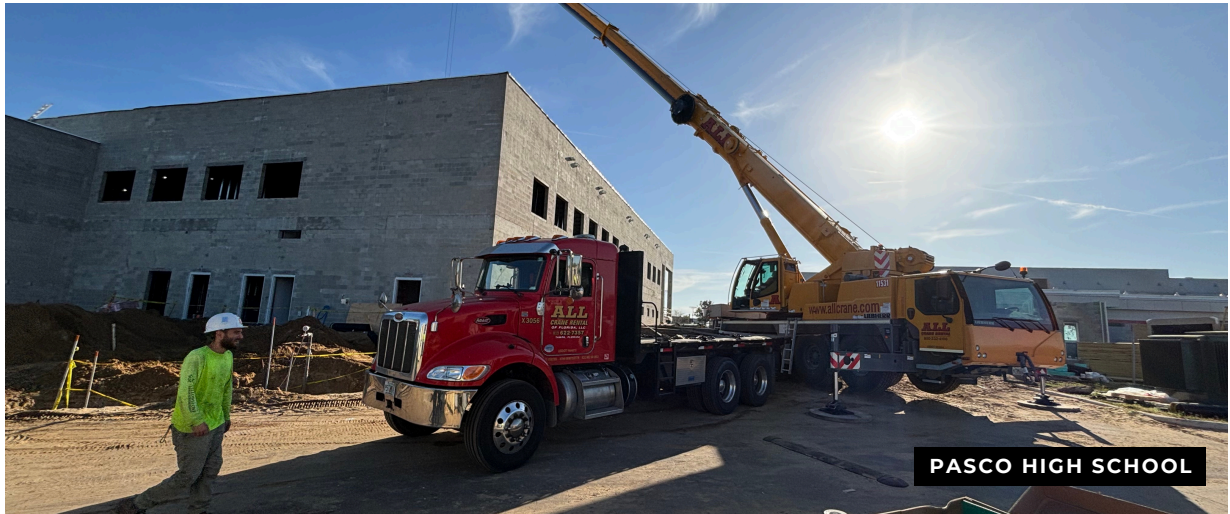
PASCO HIGH SCHOOL