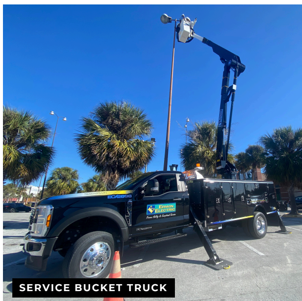
SERVICE BUCKET TRUCK