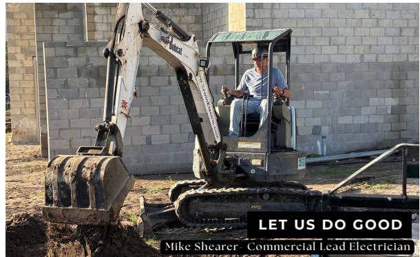
LET US DO GOOD