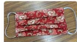
Homemade face mask recommended to prevent spread of COVID-19

Don’t have a bandana? A square dinner napkin works too!